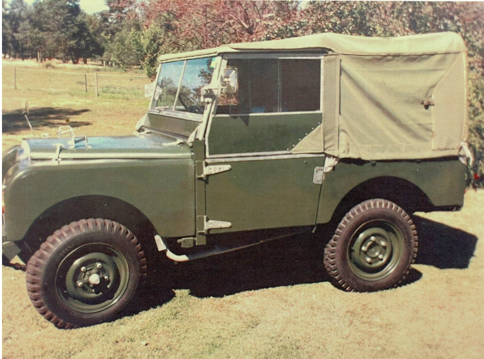
The "Landy" back home