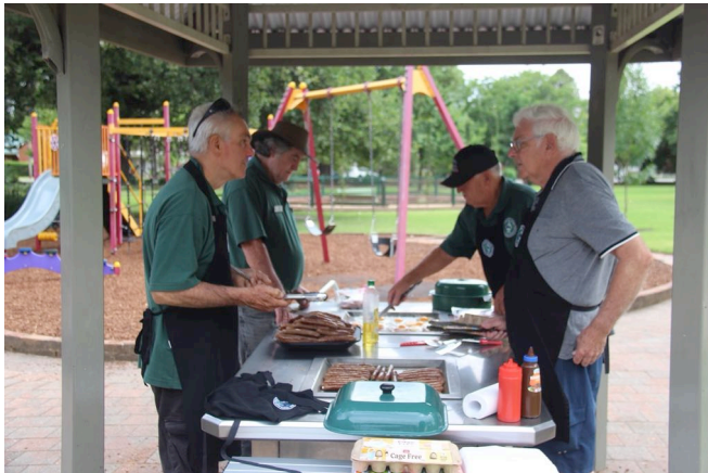
Some busy helpers

On Sunday January 5, 39 club members met at the Club rooms. Most then proceeded on a run around Lake Albert, travelling on Koorungal Rd, Vincent Rd, Kyeamba Ave, Alder Rd, Sycamore Rd, Brunskill Rd, Mitchell Rd to the destination of Butterbush Rd. This is a relatively new area of Wagga with many large houses that most had not seen. This along with a drive in the country was the goal of the route. The return trip was via Lakehaven Dr, and Plumpton Rd.