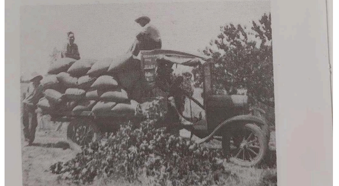
The T Model truck when it was in action