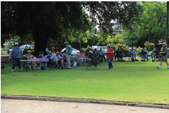
The cool shady park

The relaxed park setting provided the perfect opportunity for members to catch up and enjoy each other's company.