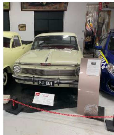
The first EJ Ute.