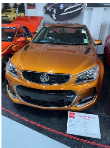
The last Series 11 SS Ute.