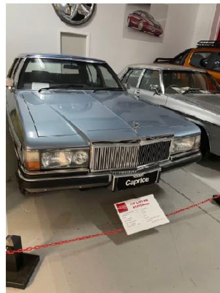
The last WB Statesman produced by Holden.