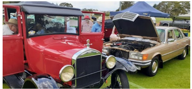
The old helping the new