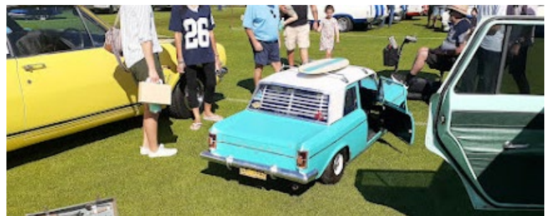
Wouldn't the grandchildren love this little beauty.