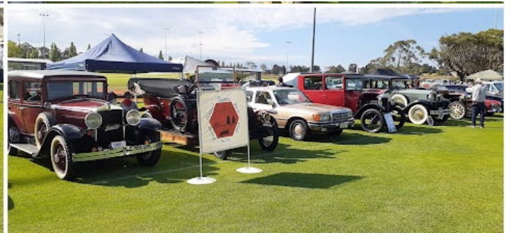
ODAMC cars making a great display