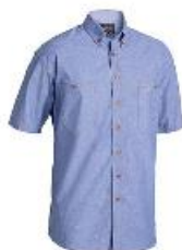
Short Sleeve Shirt with Embroidered Club Logo