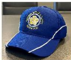
Club Cap with Embroidered Club Logo