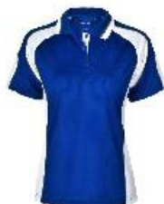
Ladies Polo Shirt with Embroidered Club Logo