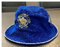
Club Bucket Hat with Embroidered Club Logo