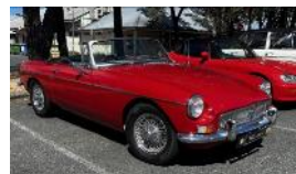
Some of the Club members' cars on the President's run.