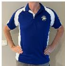
Mens Polo Shirt with Embroidered Club Logo