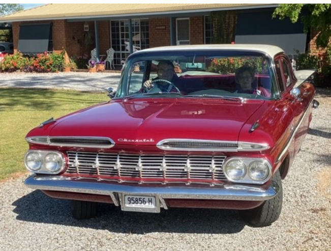
Grout's leaving in their Chev