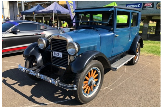
1927 Essex – oldest car on show – photos by Gary