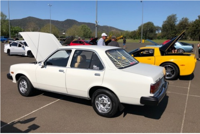
Jamie Toole's 1981 Gemini