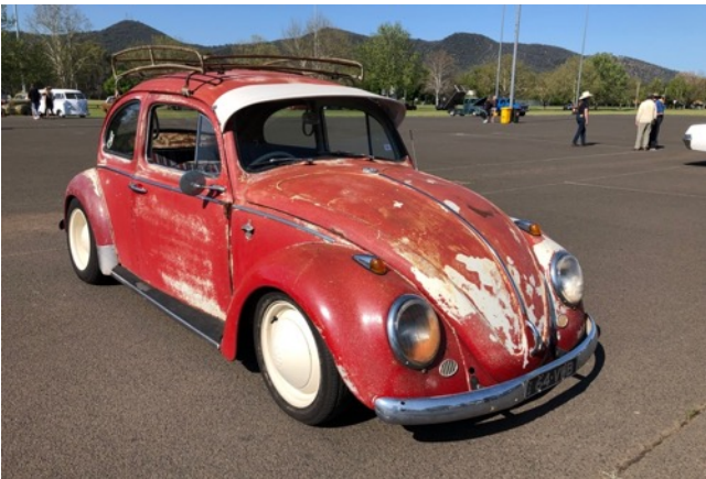
1964 Volkswagon with lots of patina