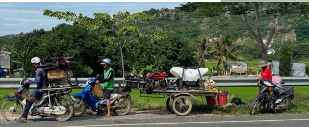
in Cambodia