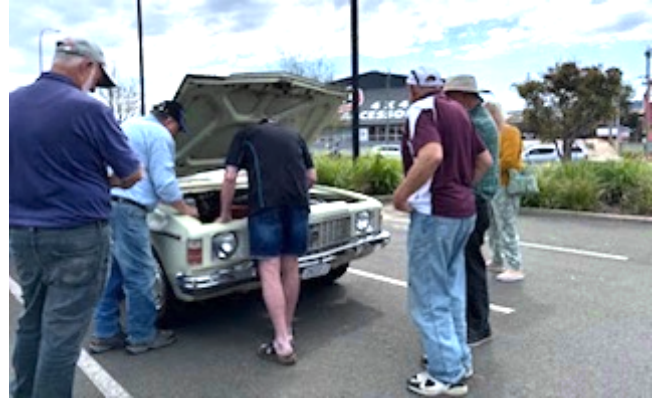
The original Kingswood created a bit of attention