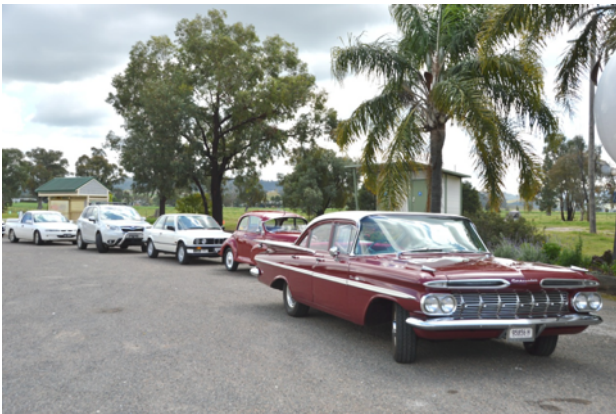
Cars at Attunga Park

Morning tea and a chat was at Attunga park, sun was shining but the gusts of wind were quite cold. We then travelled along Top Somerton Road, still on the tar, to club members Gary & Karen Turner's property. A pretty drive, countryside looking lovely and green with a touch of yellow wild mustard weed, a bit too late to see the canola crops in flower.