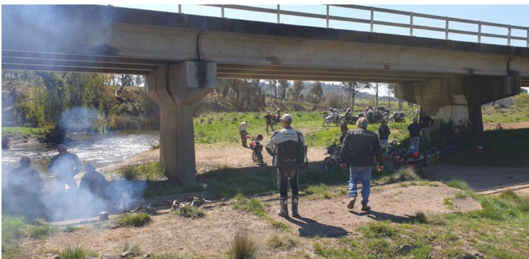
Boiling the billy under the Aberbaldie bridge - not a smoking ceremony - Photos by Barry Thomas