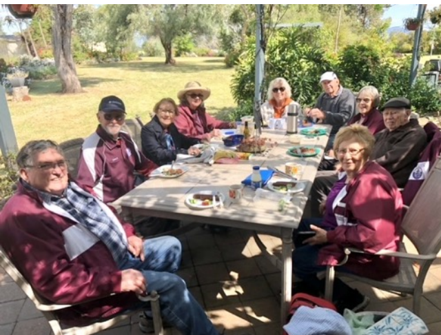
Under the pergola for lunch with sun filtering through