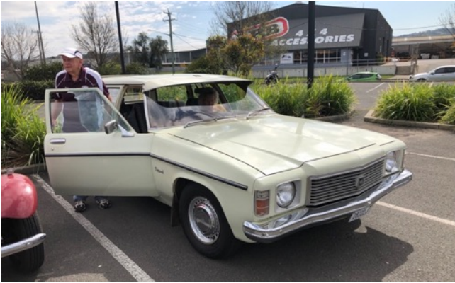
Grierson's arriving in their 1975 Kingswood