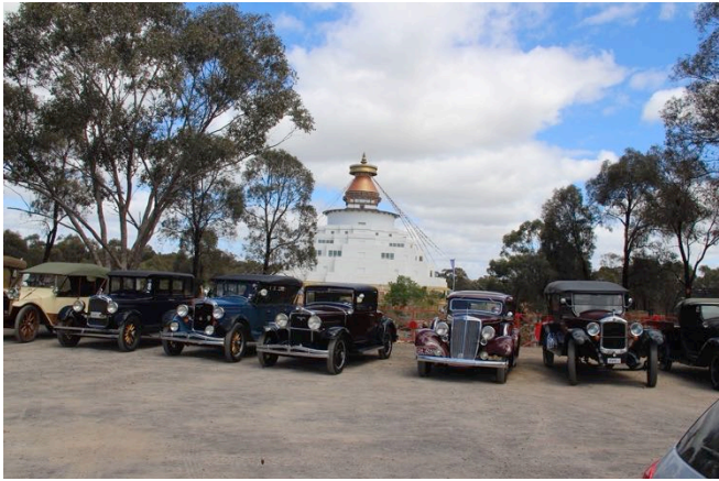
Hupps with the Great Stupa of Universal Compassion in the background