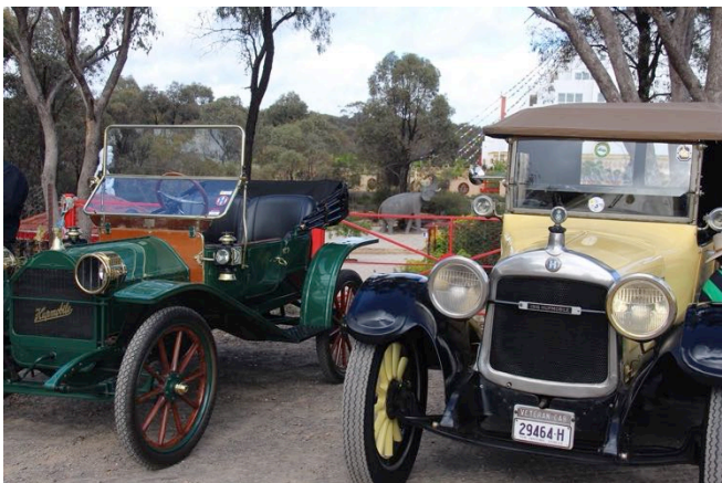
1913 and 1916 Hupmobile

From the Stupa we proceeded to lunch and tour of Ravenswood Homestead. I again travelled in the 1913 vehicle. We were amused by the number of Hupps that overtook us to then not arrive before us at the homestead. Most took a scenic detour of some description. The homestead is occupied at the weekends and mostly operates as a wedding venue. We partook in another lovely lunch and then had our Tour photo. We had the 18 vehicles lined up in chronological order. Sadly two cars didn't participate in any drives but the third and oldest car was on the road the next day.