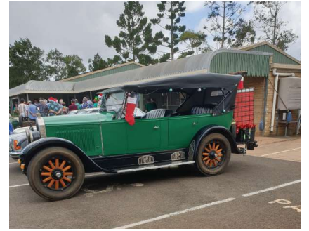
Best Dressed Car; Ken Forster's 1925 Buick.