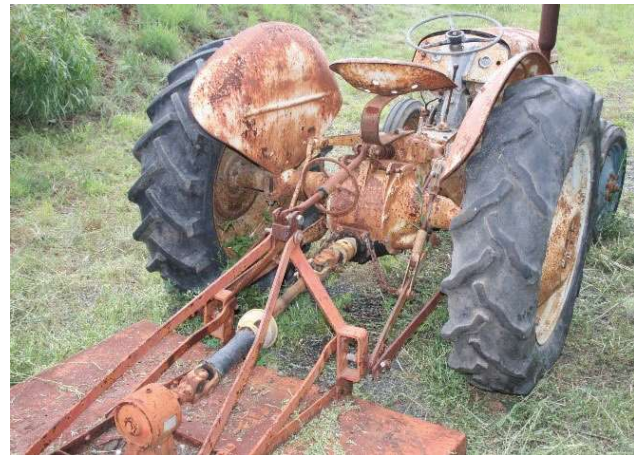
Located in the Glencoe area