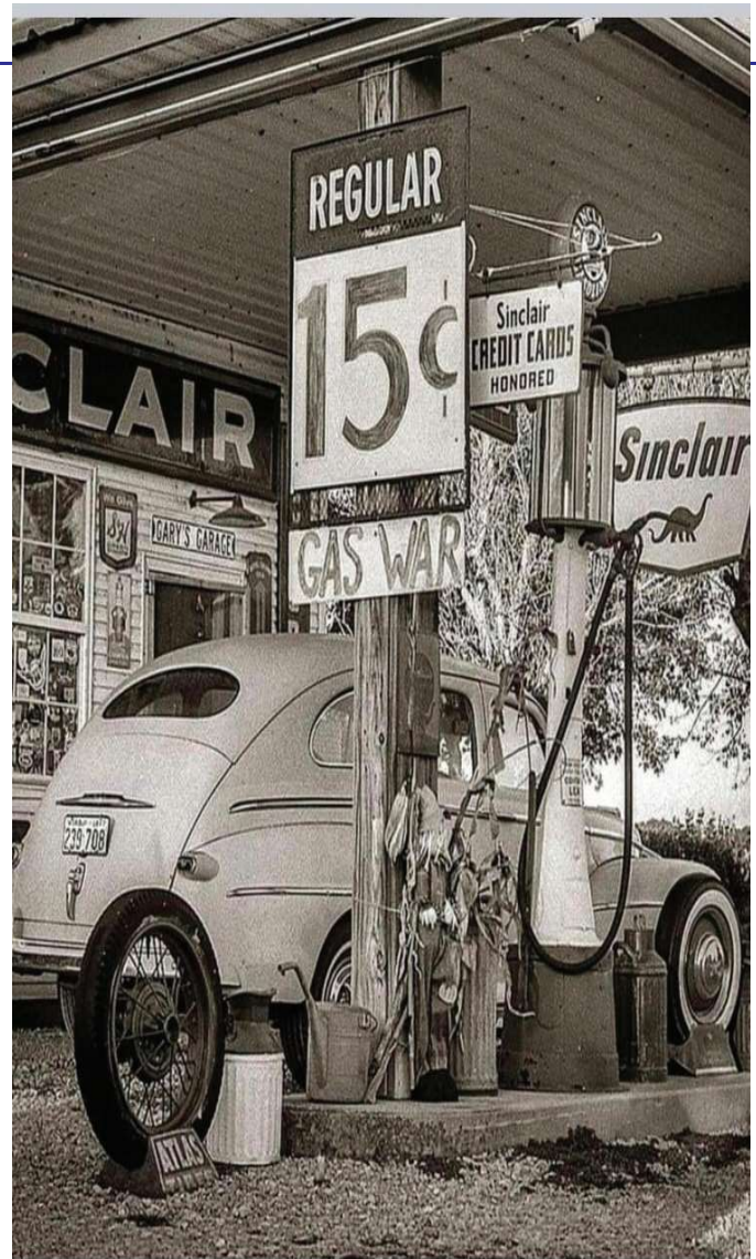
Those were days

Hi everyone....All is going to plan so for for the Toowoomba Swap on 3rd and 4th February.....only a few weeks to go!