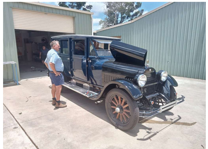
The Hudson leaves the workshop for the first time under it' own steam. Congratulations to all who have worked on this project