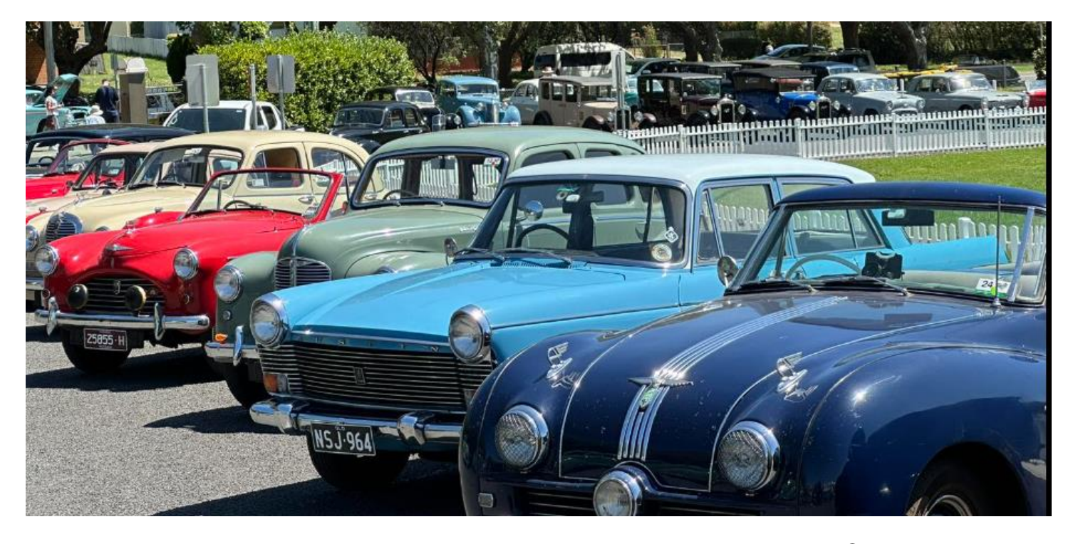
Red A 40 sports convertible, A 40, Austin Freeway & Austin Atlantic at Redmond Oval Millthorpe