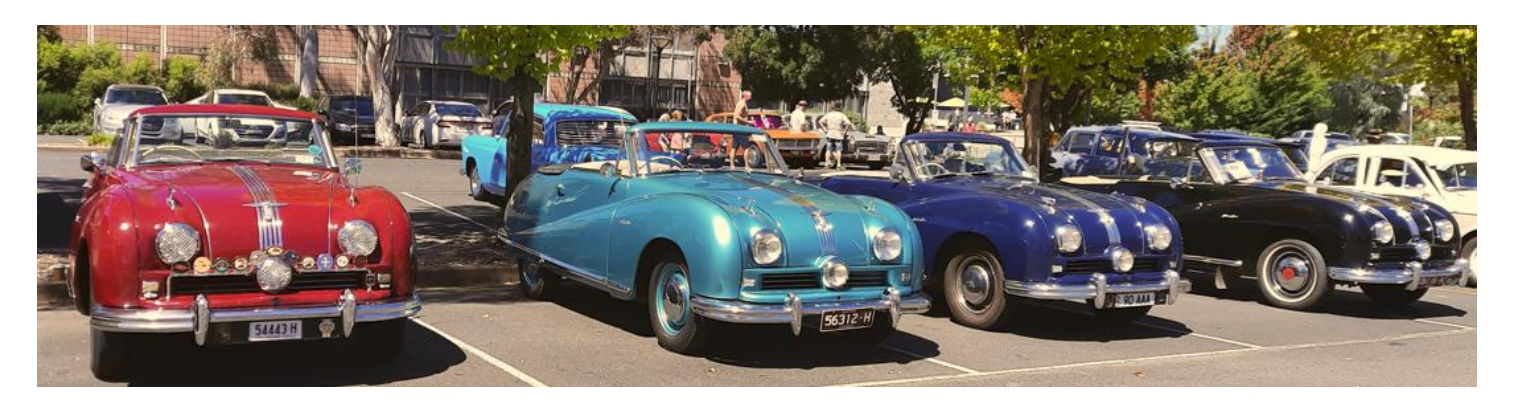
A line up of Atlantic's above and pre 1931's below

There were also several Austin A90 Atlantic vehicles entered. These were manufactured from 1949-52 and 7,981 were built in England. 350 were exported to the USA but it is not known how many came to Australia. It was a 4-seater convertible with a top speed of 91mph and had a 88 bhp motor. For an extra £40 you could have a hydraulic roof fitted and hydraulic wind up windows.