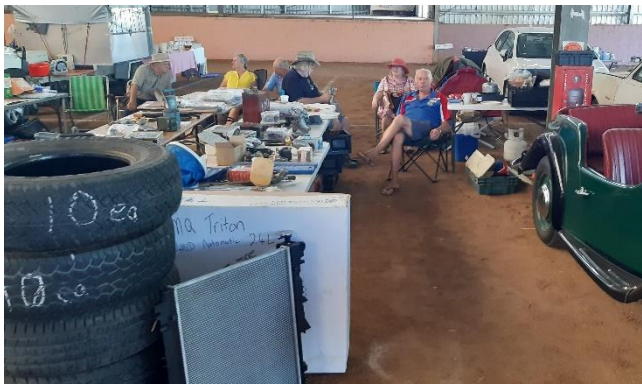
The gangway is clear for the customers come one come all