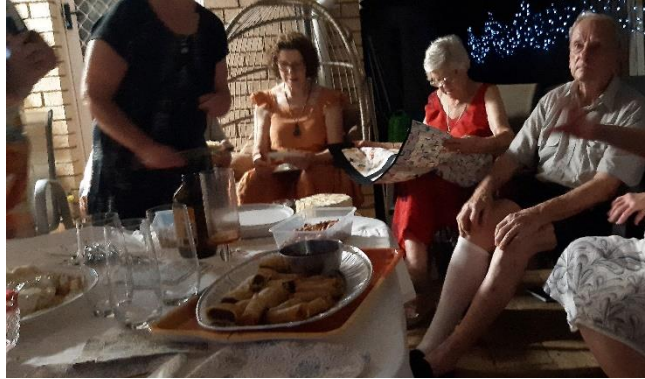
Opening gifts a golf themed table runner