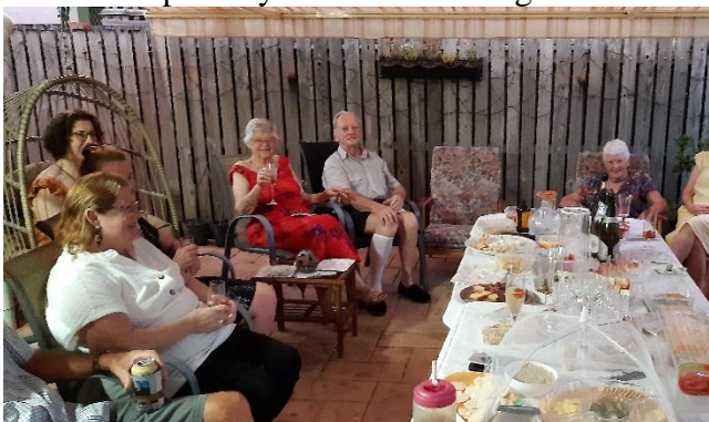
A stunning table of goodies to go around