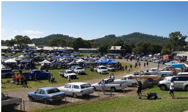
Robbie's quote of the day "I will meet you at the blue gazebo"