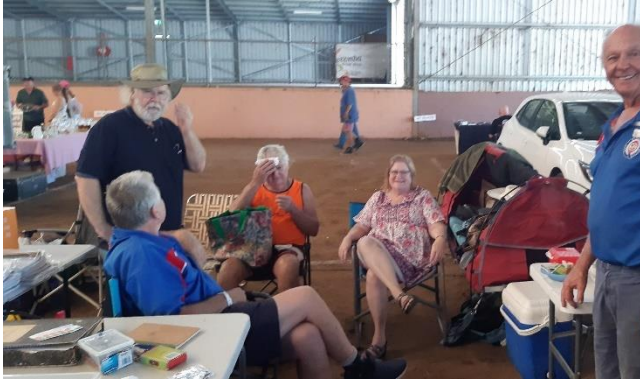
A happy spare parts officer entertaining the troops while they have a sit down and recuperate

The 50th Toowoomba Swap Meet was held on the first weekend of February 2024 at Toowoomba Showgrounds. There were approximately 1700 sites selling cars and car parts, motorcycles and parts, collectables, bric a brac, car models. The early birds got to Toowoomba on Friday and went to the Golf Club for dinner, very nice!!!