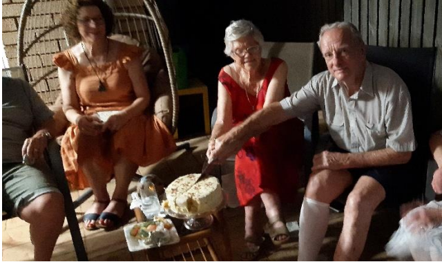
Cutting the yummy cake