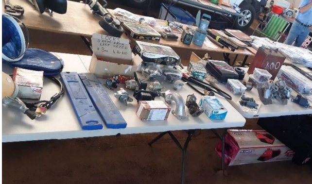
Lots of booty for sale