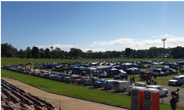
A good display of cars around the outside arena