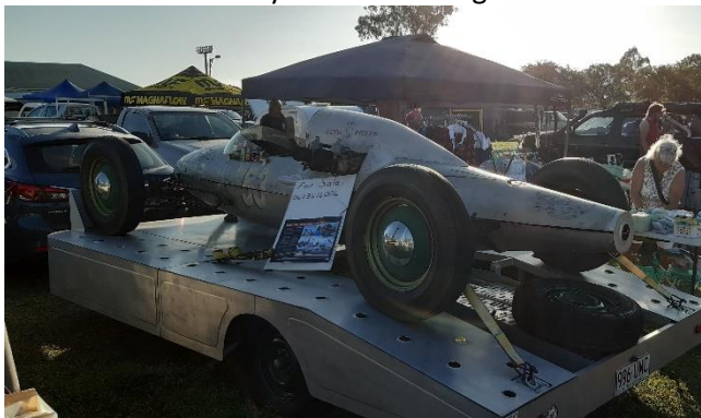
1941 WWII Belly Tank Car Devil Power - interesting