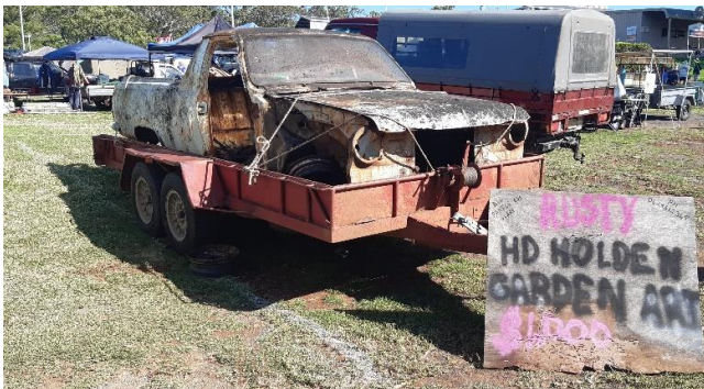
We think Rusty has started a sideline in garden art rather than try and keep them going