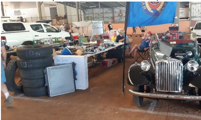
Flying the Singer flag at the Singer spares stall